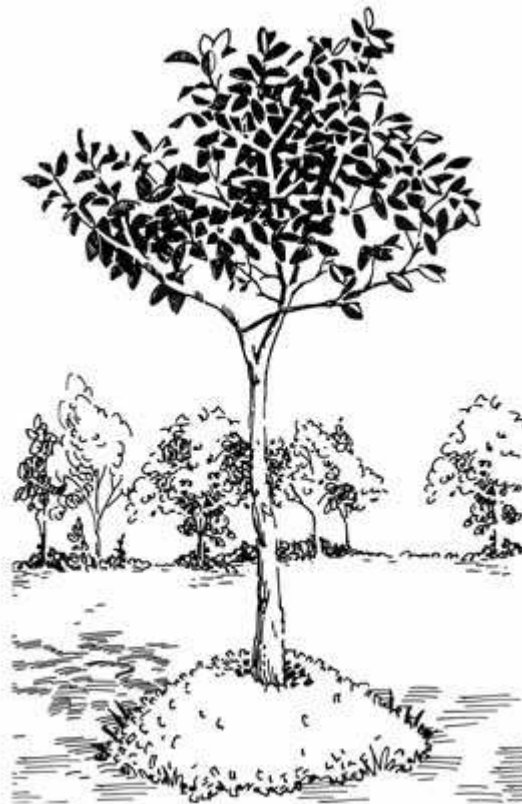
“Mulch volcanoes” cause many problems for trees.

As beneficial as mulch is, too much can be harmful. The generally recommended mulching depth is 2 to 4 inches. Unfortunately, many landscapes are falling victim to a plague of over mulching. A new term, “mulch volcanoes,” has emerged to describe mulch that has been piled up around the base of trees. Most organic mulches must be replenished, but the rate of decomposition varies. Some mulches, such as cypress mulch, remain intact for many years. Top dressing with new mulch annually (often for the sake of refreshing the color) creates a buildup to depths that can be unhealthy. Deep mulch can be effective in suppressing weeds and reducing maintenance, but it often causes additional problems.