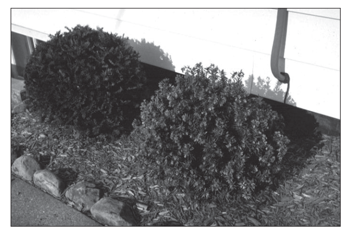
Figure 1. Taxus showing above ground symptoms of Phytophthora root rot. Note the off-colored foliage and lack of vigor.

The first symptom of poor root health is usually dull foliage color (Figure 1). Sometimes leaves turn yellow and wilt. These changes may occur quickly or may take months to develop. Woody perennials such as trees or shrubs may live in a state of reduced vigor and decline for years.