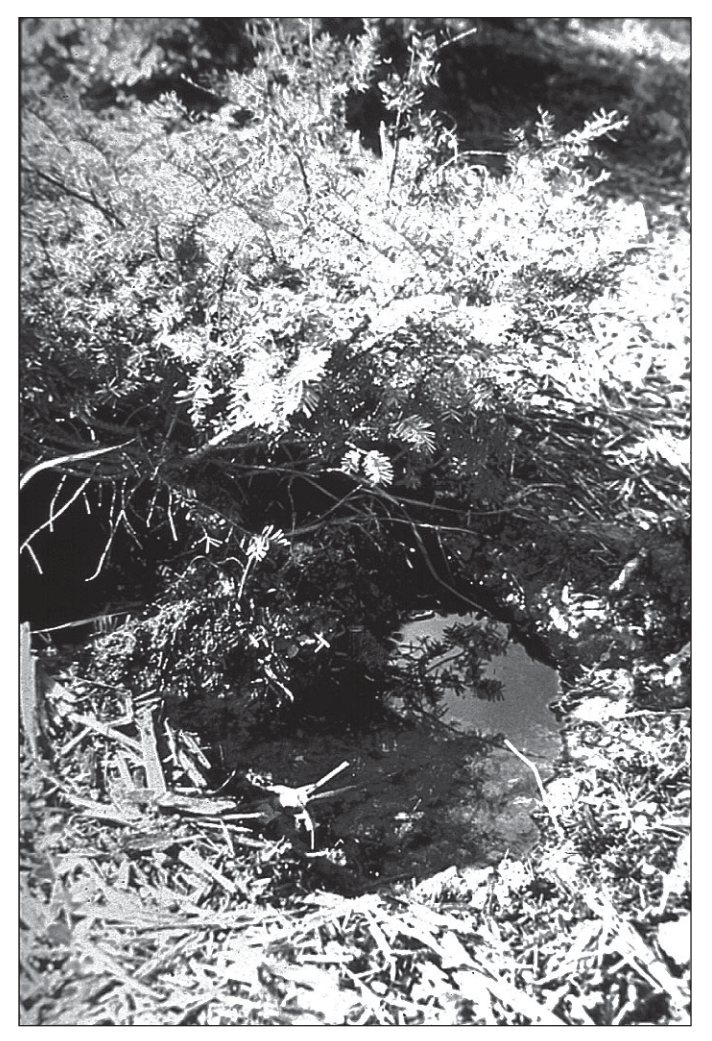
Figure 6. Standing water at the base of a Taxus plant. Note that the plant is dead.

measures are usually special cases. For good plant growth on such sites, they are necessary.