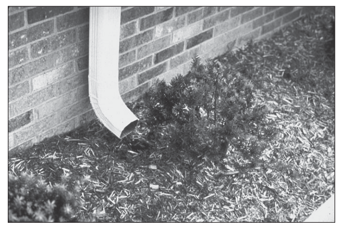
Figure 5. Taxus planted at base of drain pipe. Conditions such as this result in excessive soil moisture during rainy periods.