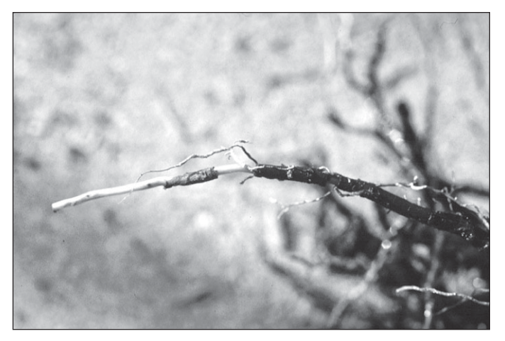
Figure 3. Outer root tissues have been rubbed off this rotted Taxus root leaving the central core.

wood is often brick red or brown and there is a sharp line of demarcation between healthy and infected tissue (Figure 4).