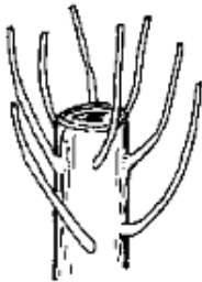
New shoots develop profusely below a topping cut.

Topping often removes 50 to 100 percent of the leaf-bearing crown of a tree. Because leaves are the food factories of a tree, removing them can temporarily starve a tree. The severity of the pruning triggers a sort of survival mechanism. The tree activates latent buds, forcing the rapid growth of multiple shoots below each cut. The tree needs to put out a new crop of leaves as soon as possible. If a tree does not have the stored energy reserves to do so, it will be seriously weakened and may die.