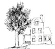
Trees that have been topped may become hazardous and are unsightly.

Without leaves (up to 6 months of the year in temperate climates), a topped tree appears disfigured and mutilated. With leaves, it is a dense ball of foliage, lacking its simple grace. A tree that has been topped can never fully regain its natural form.